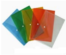
A4 envelope folders (4)

A4 notebooks – Grade 4 plain– (3) squared (2) lined (6)