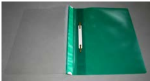
A4 Soft Plastic Folders (5) 4 for class and one for MFL Lessons

You can bring an iPad with a specification less than 64GB, but please be aware that problems related to storage may be experienced. We recommend that insurance is purchased for the iPad and that students bring the iPad to school in a sturdy cover.